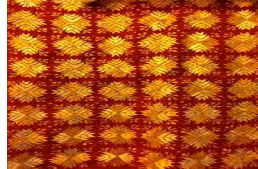
Floss Silk Tree